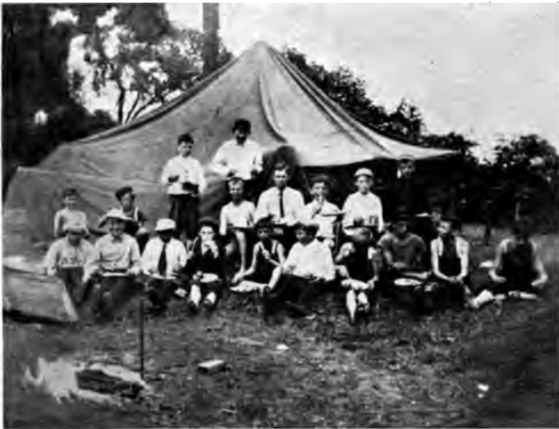
A WEEK-END CAMP